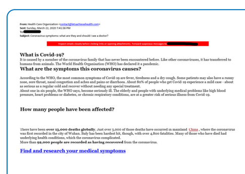
Figure 2: Sample phishing email

Continue to use common sense and implement best practices in all aspects of your network – and day-to-day – environment.