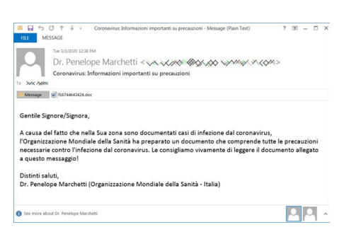
Figure 1: Sample spam campaign

An extensive number of threat actors are leveraging techniques from phishing campaigns to malware infrastructures like <a href="Trickbot">Trickbot</a> and Lokibot to deliver malware globally.